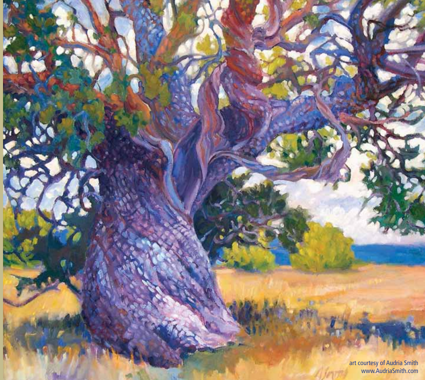
art courtesy of Audria Smith www.AudriaSmith.com